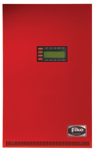
Fike CyberCat 254

These devices use the SLC signaling line circuits to exchange status information with other devices as well as with the control panel. When an input is activated, it is configured to cause its associated zone to enter into an operational state. Any detection device will cause its associated zone to enter into an alarm state. The output devices are configured to activate to protect and evaluate the endangered zone. This system is completely modular, allowing you the flexibility to design a system that is just right for your application. A typical configuration is shown on page 2 that illustrates the communications of a CyberCat system.